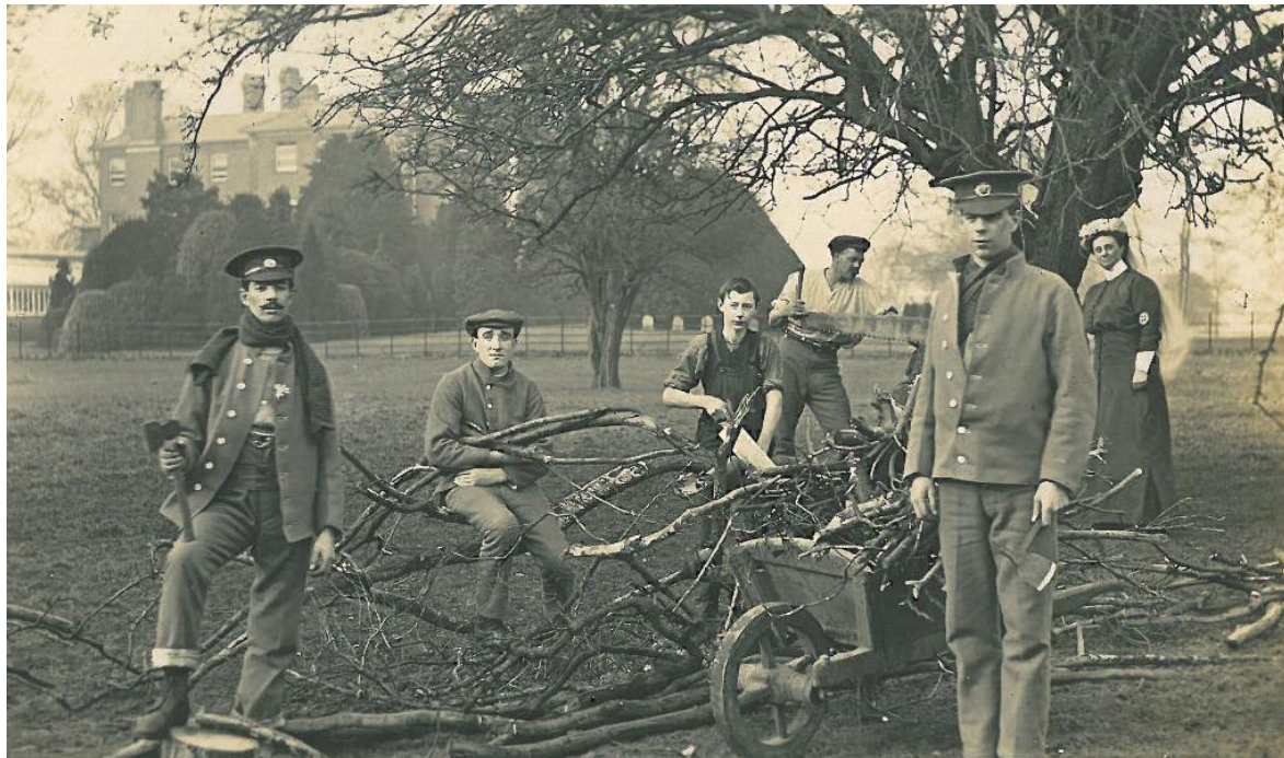
Photographs of patients at Boultham Park Military Hospital. Document reference: BOULTHAM PAR 23/26.